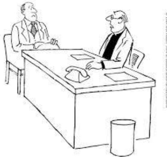
"It's a tricky theological point. You say you covet your neighbor's humility?"

Covetousness is certainly a major problem, but humility is a more basic one.