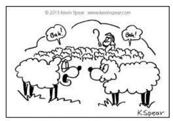
"Don't get me wrong. Hove our shepherd. It's just that I prefer a different style of herding."

From the viewpoint of most of the Jews of Jesus' day, Jesus' leadership style was very different from what they thought they needed. 5000 men gathered to be with him, and after a long day of listening to his teachings, they enjoyed a meal of fish and bread with more than enough to satisfy their immediate hunger. Most would agree that a Shepherd's first responsibility is to make sure that his sheep are fed. They saw in him the leader that they thought they were looking for. In fact, they wanted to make him more than just a shepherd. They wanted to make him king.