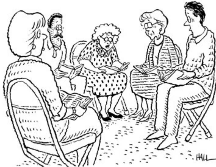
Well, I could have cast the first stone!

While I don't know anyone who would actually say they are without sin, we are sometimes guilty of feeling justified in 'casting stones' at others because (1) we are in denial of our own sins, (2) we regard the sins of others as more grievous than our own, or (3) we think of our own sins as momentary failures, while regarding others as belonging to a category labelled "sinners".