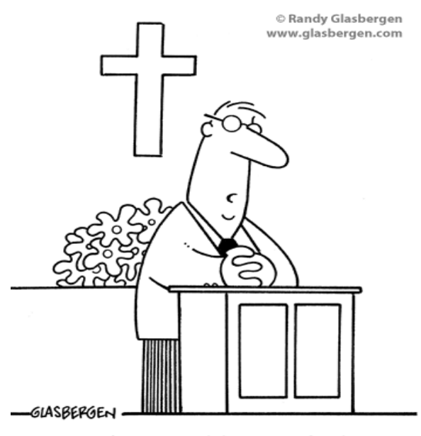
"Forgive us our debts as we forgive those who call to harass us about our debts..."

A prayer for those who put too much "Christmas" on charge cards: